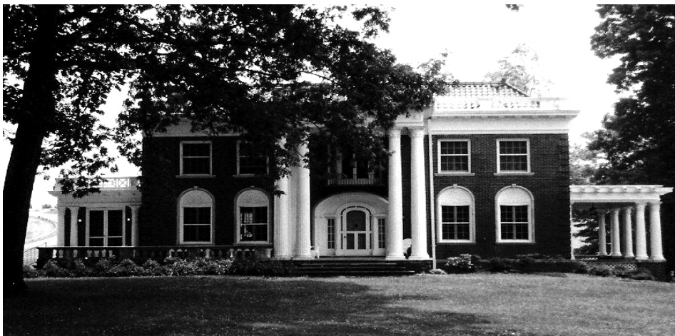
Heck Mansion, Roane County, above; Governor’s Mansion, Kanawha County, below