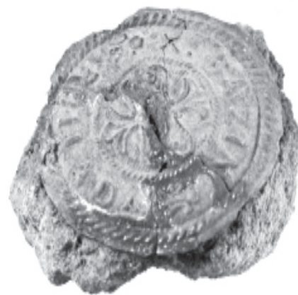
Bulltown Historic Area and artifacts (Ceramic shard, left; Ammunition, center; Bottle seal, right).