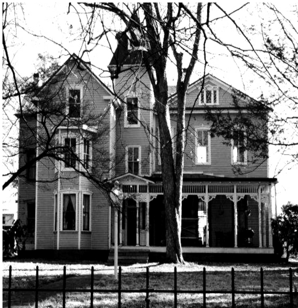
Brown-Shugart House, Jefferson County

In 2008, the West Virginia Division of Culture and History officially opened a new state-of-the-art archaeological collections management facility at the Grave Creek site in Moundsville. The $3.1