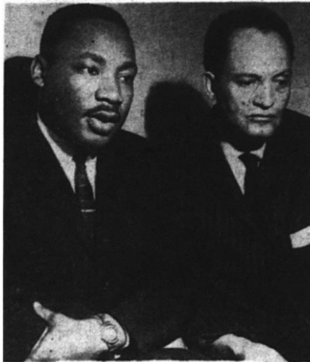
HOPES FOR DESEGREGATION

Sitting in his room at a downtown hotel, the man who was stabbed, arrested and who had his house bombed as a result of his activities in the racial field, said he envisioned more than the white South merely conforming to the law: