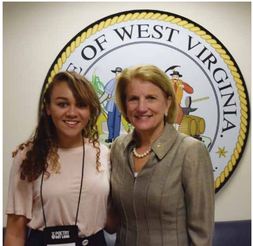
Below: While in the nation’s capital, Neely Seams met with U.S. Senator Shelley Moore Capito.