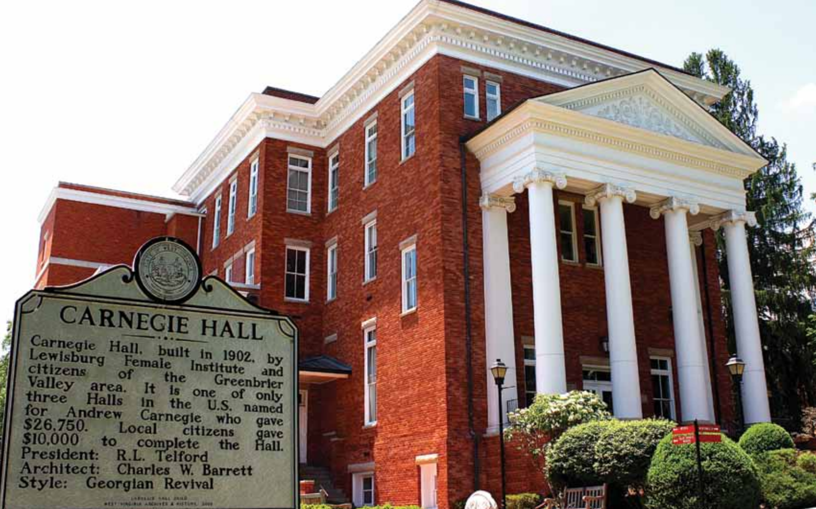
Lewisburg's Carnegie Hall, built in 1902, is designed in the Greek revival style.