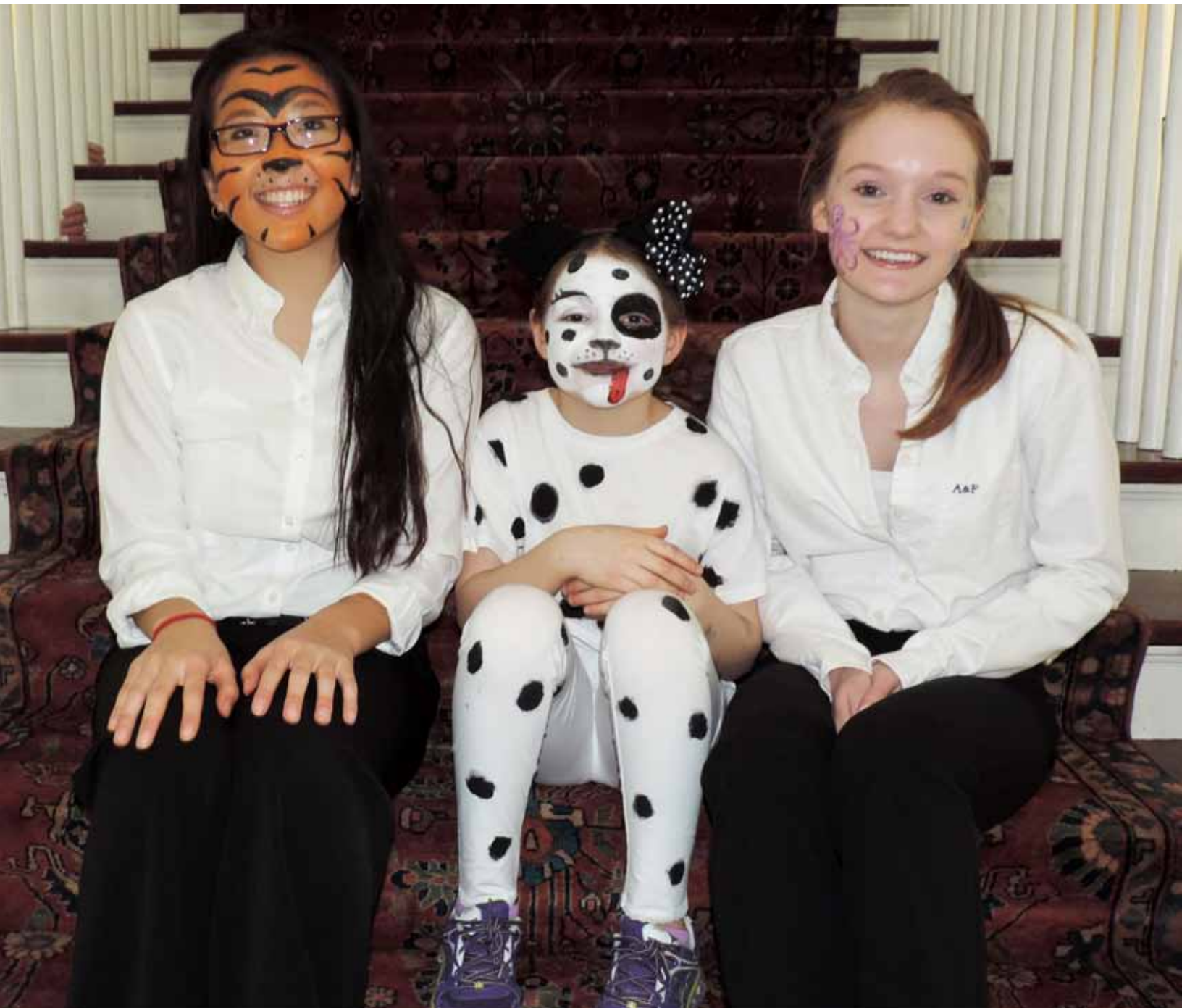
Patrons at the Stifel Fine Arts Center dress up as their favorite cartoon characters.