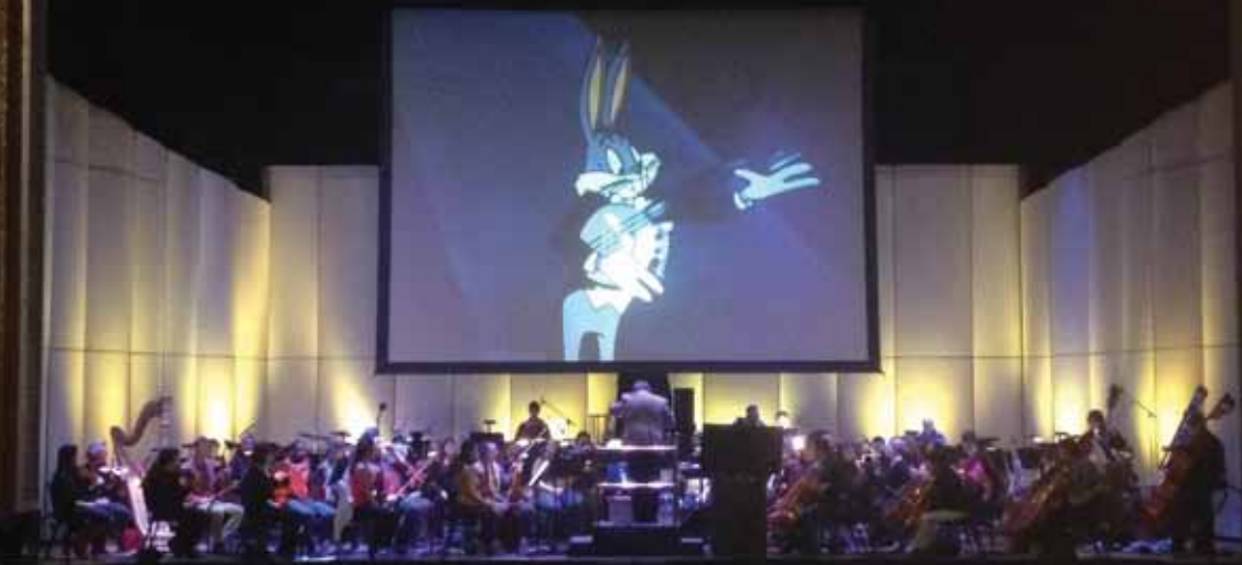
The Wheeling Symphony practices for its Bugs Bunny at the Symphony II concert.