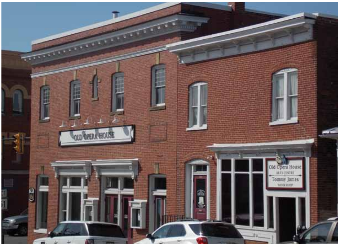
Above: The Metropolitan Theatre, built in the neoclassical revival style, opened in Morgantown in 1924.

Opened as the Plaza Theatre in 1912, this Charleston theater was remodeled in 1921 with a Wurlitzer pipe organ, a projector room, 30-foot electrical sign and a marquee. (Listed 1985)