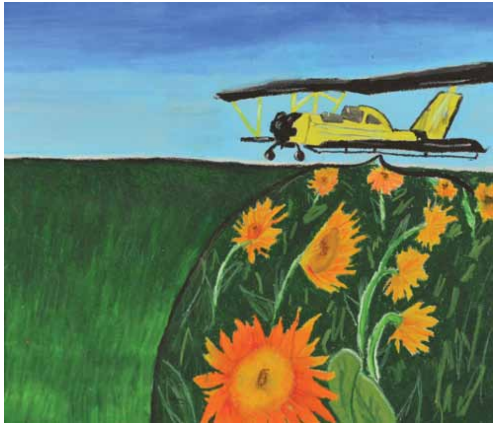
This was one of many 2014 entries for the West Virginia Science, Engineering and Art Fair.

The competition, now in its third year, is designed to reinforce classroom efforts to stimulate enthusiasm for science and career-related skills through academic