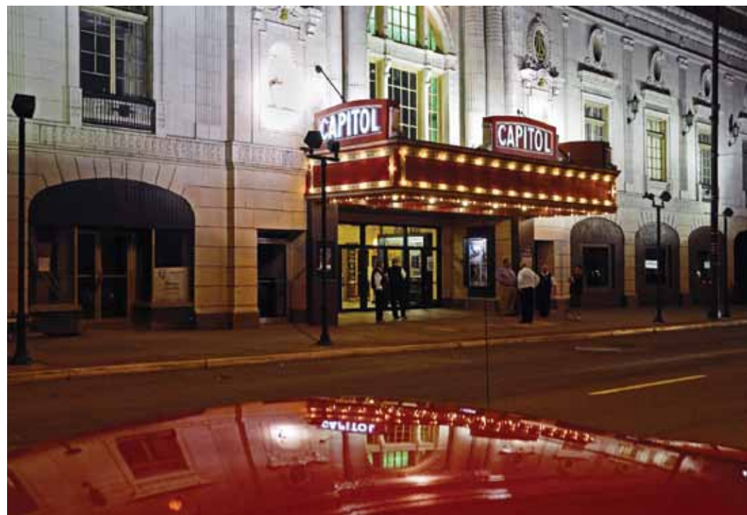
Architect Charles W. Bates designed the Capitol Theatre in Wheeling in the Beaux Arts style.

This 1926 vaudeville house in Parkersburg with imposing Neo-Classical facade and brightly lit marquee was remodeled in the 1930's