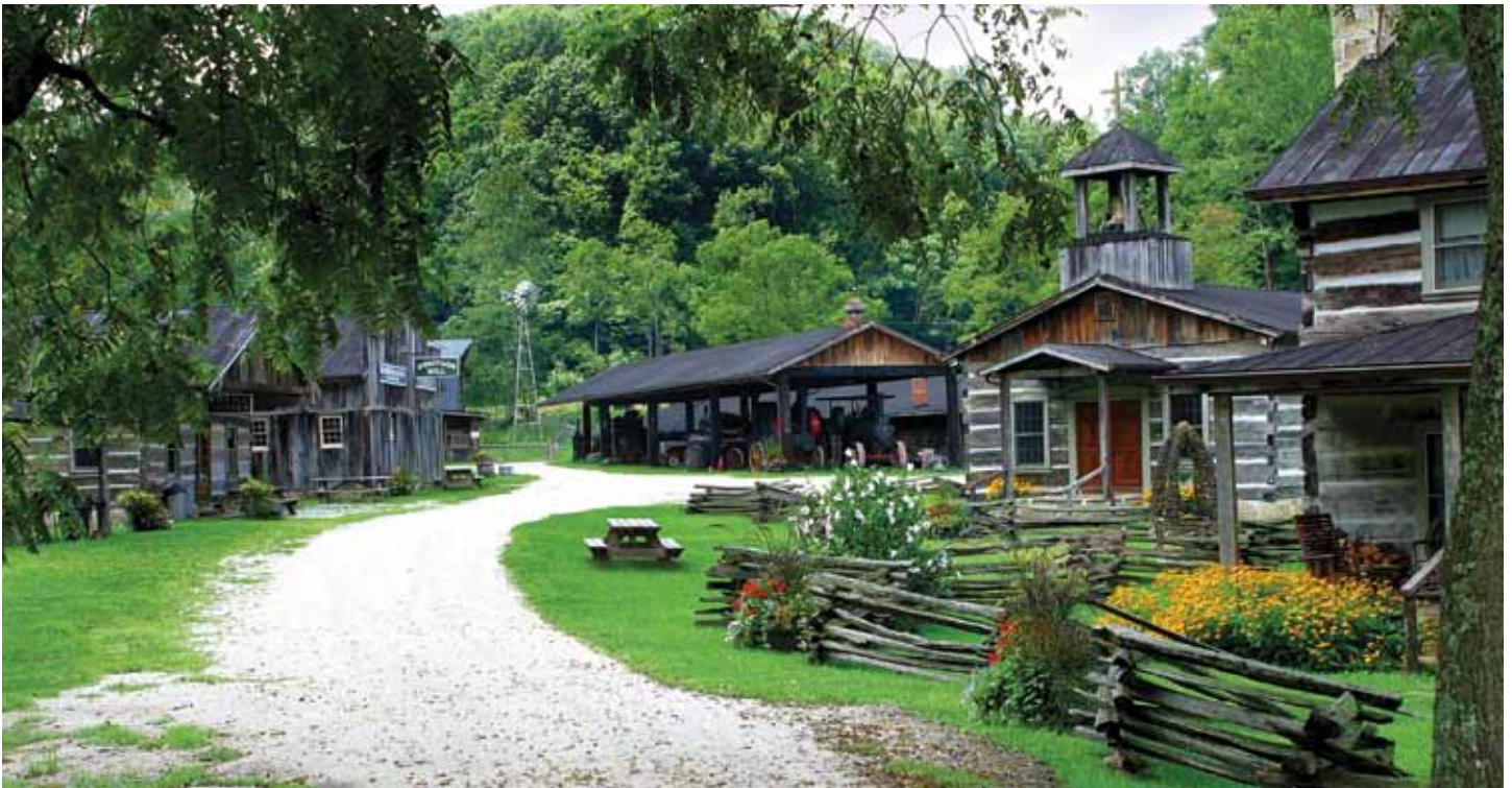
Heritage Farm Museum & Village in Huntington is West Virginia's first Smithsonian Institution Affiliate.