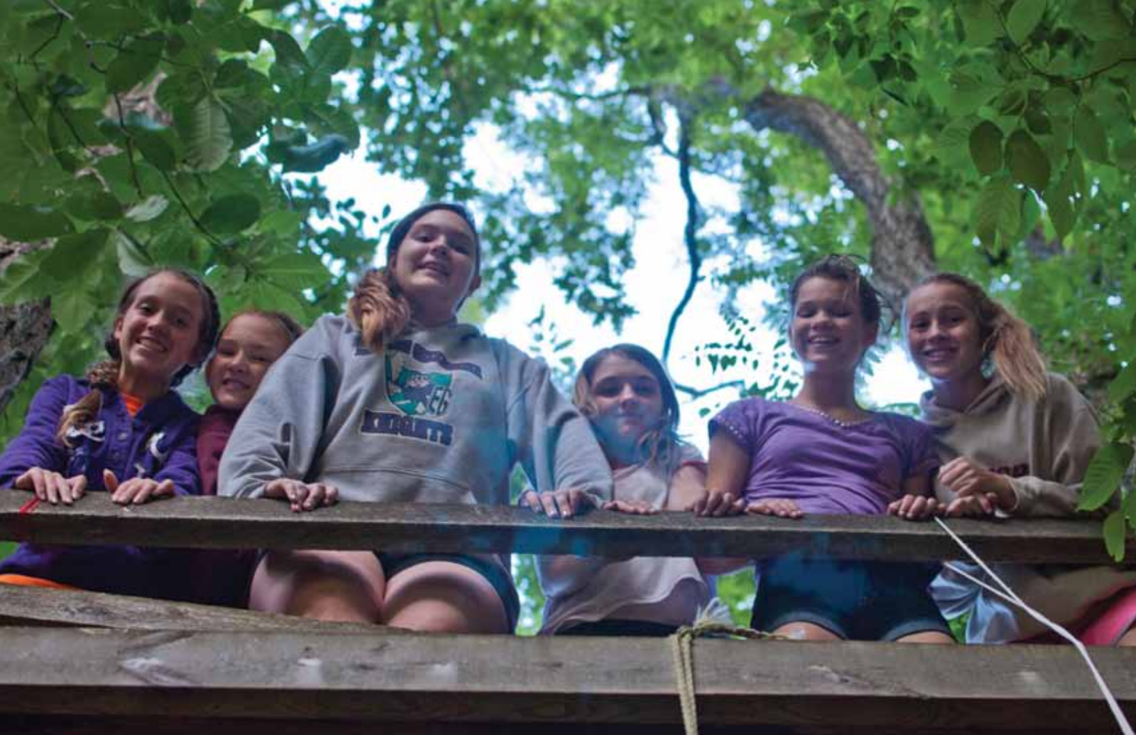
New Beginnings campers gather in a tree house.