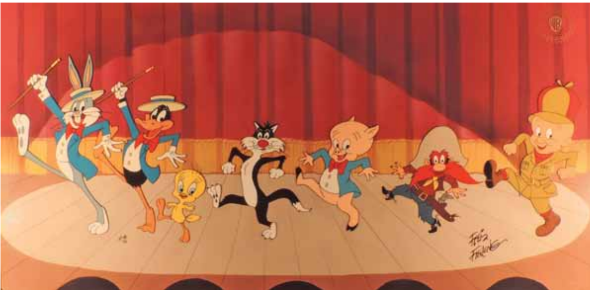
A live performance by the Wheeling Symphony complements classic Warner Bros. cartoons on a large screen.

iconic characters from multiple generations and from all the favorite studios, such as Warner Bros., Disney and Hanna-Barbera, to name a few.