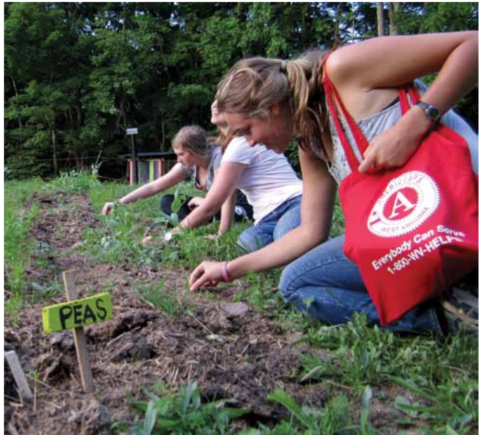
Above: A High Rocks AmeriCorps volunteer helps Camp Steele girls work in the garden.

“If they are not enjoying it and learning from it, try something else.”