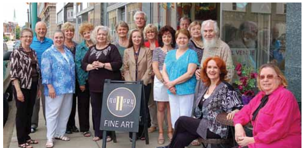
Members of Gallery 11, West Virginia's oldest co-op, gather outside their gallery in downtown Charleston.

Gallery 11 features paintings, glass paperweights, wooden bookmarks,