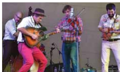
The Steel Wheels perform at the Lewisburg Music Festival.

Carnegie Hall , Lewisburg, Greenbrier County: $15,000 for the Second Annual Lewisburg Music Festival.