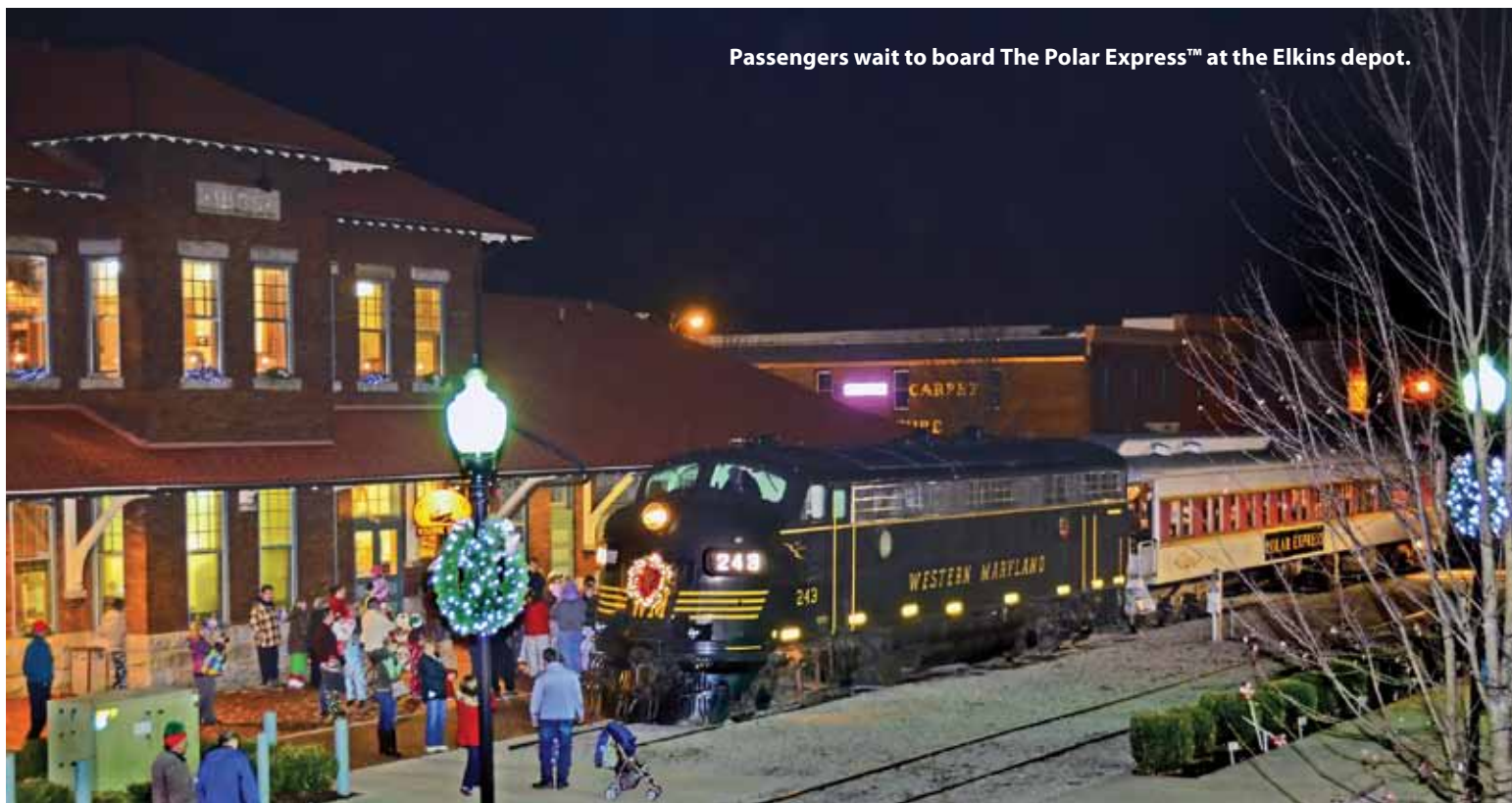
Passengers wait to board The Polar Express™ at the Elkins depot.

The staff support team helped to provide the leadership and infrastructure needed for such an ambitious effort. Four years later, a small part-time position has matured