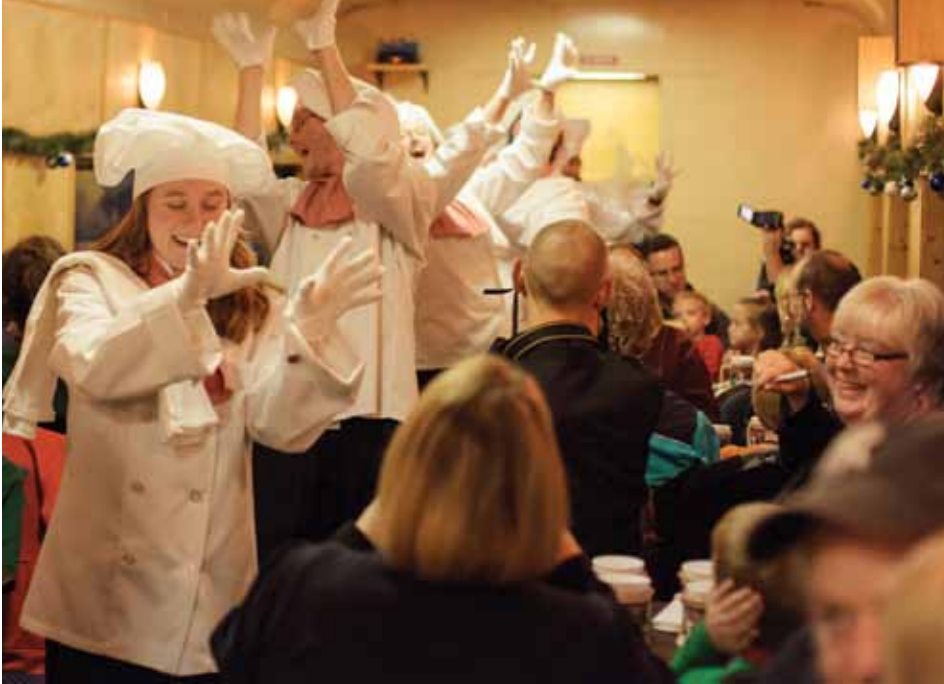
A parade of chefs dance and sing their way through rail cars onboard The Polar Express™ excursion train.

toward a common goal – to create joy. The Old Brick Playhouse, which had a full-time staff of two, a student base of 75, and community members who participated regularly in theater projects, was delighted by the unexpected success and growth of the event.