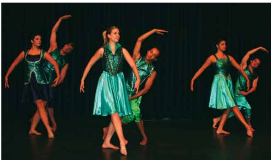
The West Virginia Dance Company performs a piece choreographed by Donald Laney.

Youth Museum of Southern WV , Beckley, Raleigh County: $17,997 to help pay for its "I Feel" exhibit, "The Wonderful Wizard of Oz" pop-up book hands-on exhibit, and the BRIO Integrated Theatre workshop for community members with special needs.