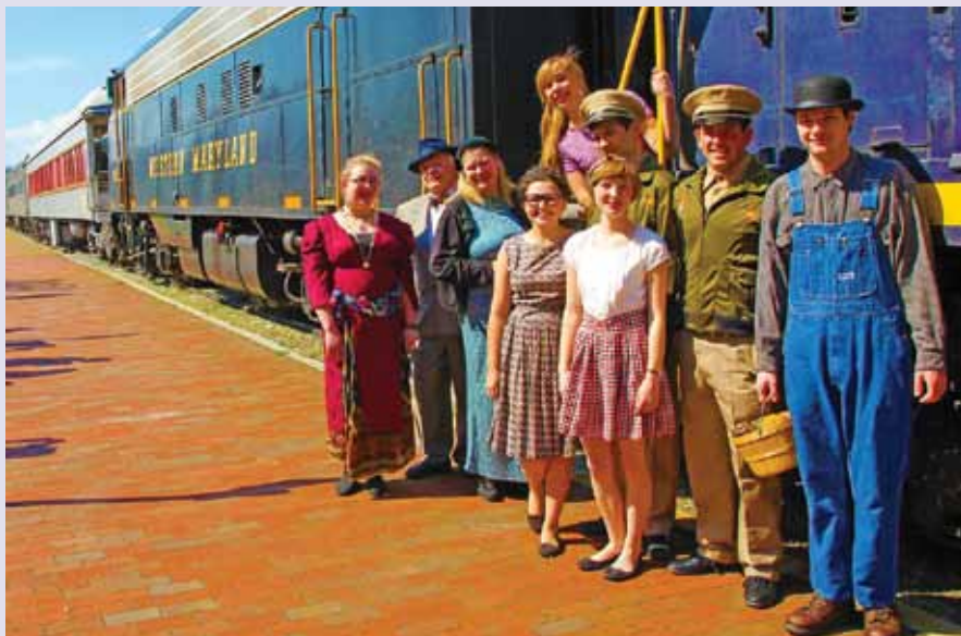
Dressed as historical Randolph County characters, apprentices and alumni of The Old Brick Playhouse perform on the rail platform at the Elkins Depot.