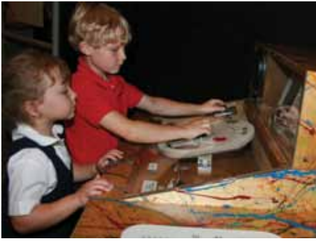
Above: Children explore the Youth Museum of Southern West Virginia's exhibition Science and Art, which is on loan from the Museum of Discovery in Little Rock, Ark.