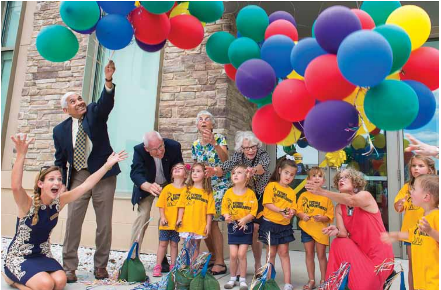
Celebrants join members of the WVU class of 2033 at the opening of the Art Museum at West Virginia University.