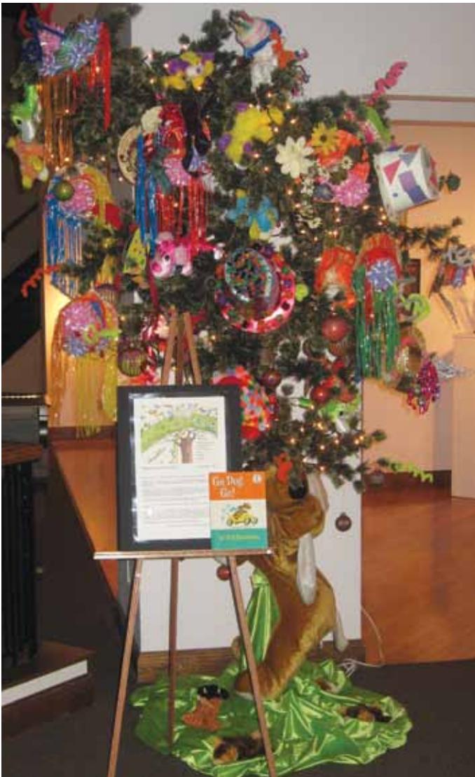
Above: PAC students ages 4-6 took their inspiration from Go, Dog. Go! , a 1961 children’s book written and illustrated by P.D. Eastman.