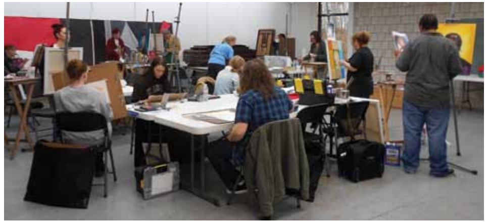
Right: Artists take part in a workshop in the Walter Gropius Studios at the Huntington Museum of Art.

a season of exhibitions, performances, events and education and community outreach programming.