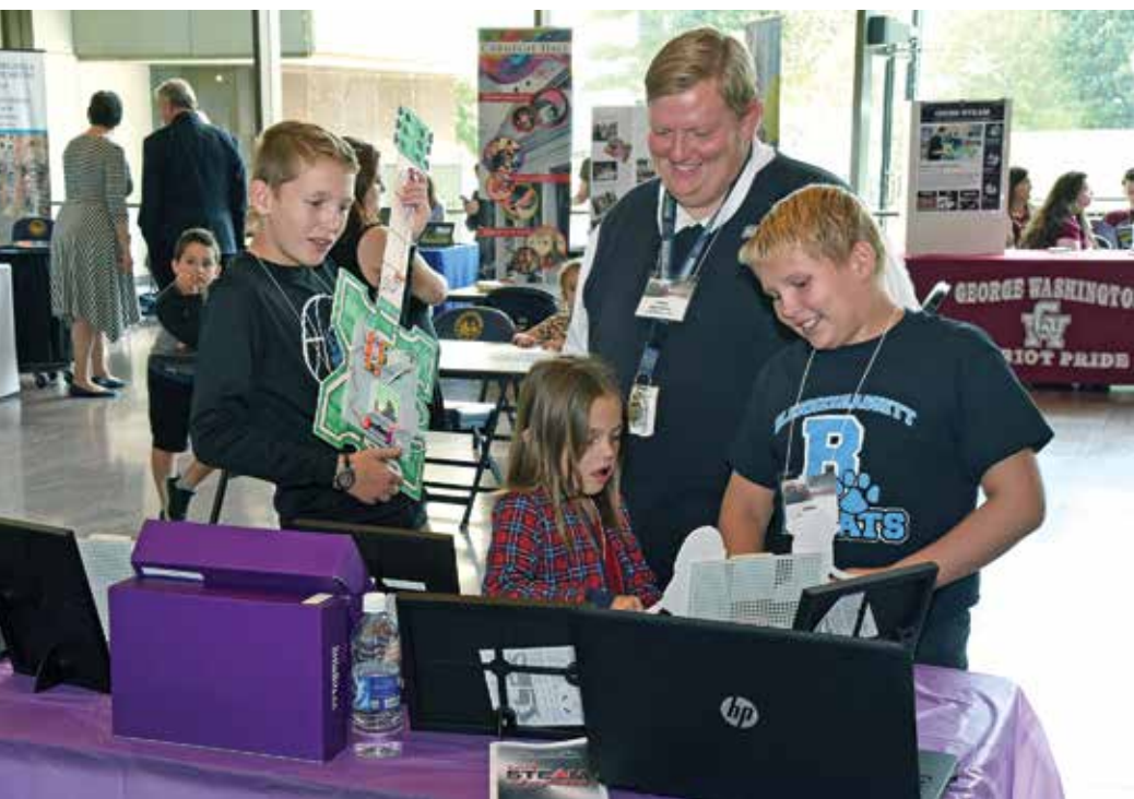
Below: Representatives from Blennerhassett Elementary School study an electronic musical instrument exhibit from the June Harless Center.