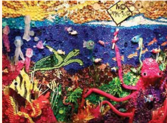
Students turned plastic into art—and a message—in this mural.

A recent permanent art installation at Morgan Arts Council's home base, the Ice House, in Morgan County, leaves most audiences with only one word on their lips: amazing!